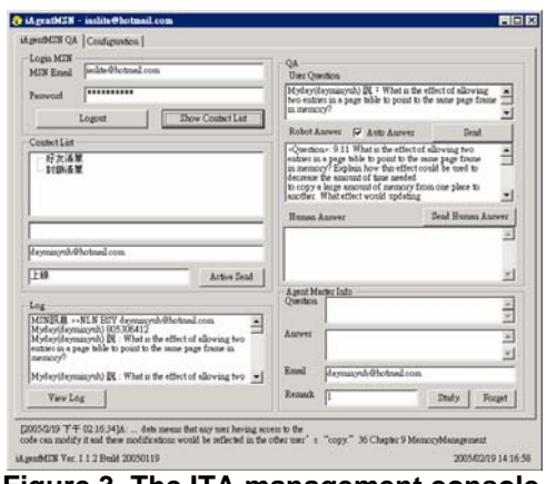
Figure 3. The ITA management console. 3. User Case Scenario and Discussion

The user case scenario in ITA is as follows. After the teacher has finished a section of the "Operating System", the teacher may give some assignment to the students, keep a record of learning objects, or answer students' questions. Initially, we use the textbook "Operating System Concept" [6] as the foundational knowledge of the ITA.